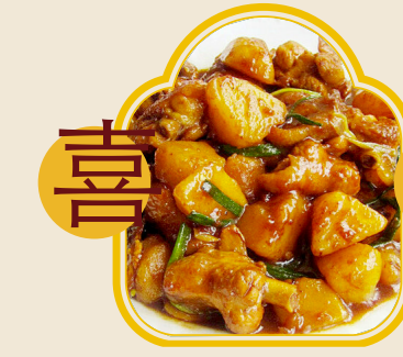
Chicken with Potato